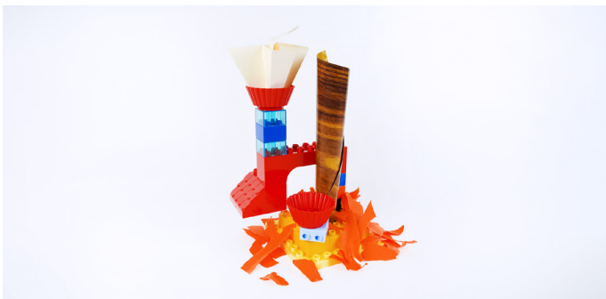
Beaver Dam Airport. This airport stands on rivers just like a beaver's dam. It generates energy from river water and houses many ecosystems while providing a space for planes to land and take off