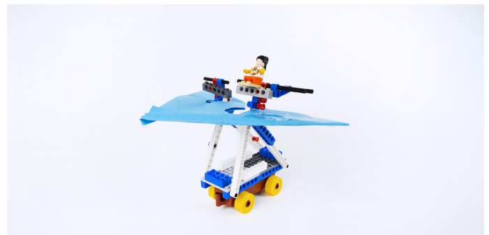
Manta Ray Rollercoaster. Just like a manta ray, this rollercoaster never stops moving. It can glide in the air, hover and swim on water!

Step 5: Using the 'Make Your Own Wild Cities Cards' resource, why not write your own cards and share them with a friend to build a whole Wild City together!