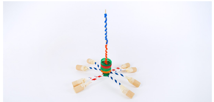
Jumping Spider Hospital. This hospital has eight legs, just like a spider and can travel very fast and on many different surfaces to get to those in need