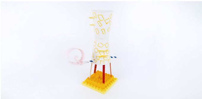
Giraffe Bakery. This bakery stays cool even when the oven is on. Its is inspired by giraffe's spots and its ability to regulate temperature.

Step 4. Use craft, junk materials and LEGO to experiment and make your building come to life! Here are some examples.